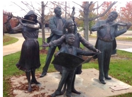
Sculpture in front of Michael A. Guido Theatre (gallery inside) Dearborn Community Theatre