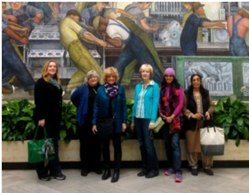
A VISIT to the DIA and the MONET exhibit. . .

There was the person who sent ten puns to friends with the hope that at least one of the puns would make them laugh. No pun in ten did.