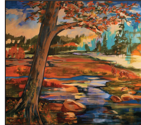
VILLAGE FRAME AWARD Janus Benda - "Safe Haven"