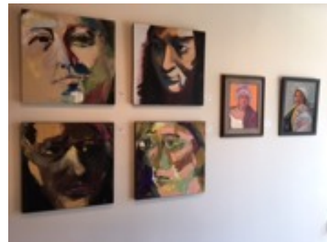
8/31 - 9/30/16 Art Show 'About Face' appearing at the Lawrence Street Gallery

Lawrence St. Gallery presented work by Mary's Muses group 8/31 - 9/30/16 .